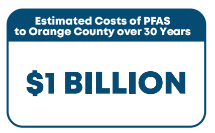
*As of July 2020 these costs are based on preliminary data and will likely increase.

Per- and polyfluoroalkyl substances (PFAS) are a group of thousands of manmade chemicals, including perfluorooctanoic acid (PFOA), perfluorooctane sulfonate (PFOS) and perfluorobutane sulfonic acid (PFBS), that are used to make carpets. clothing, fabrics for furniture, food packaging, cookware, and other materials to make them non-stick and/or resistant to water, oil, and stains. They are also used in a number of industrial processes and firefighting activities.