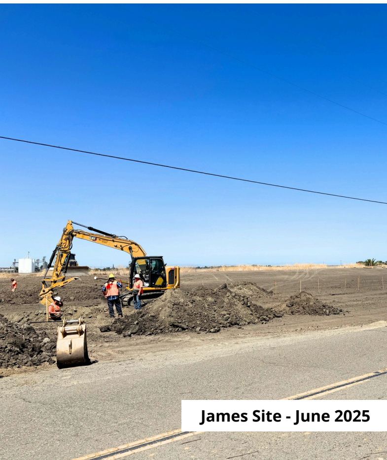
James Site - June 2025

Golden State Water is dedicated to keeping rates low without sacrificing health and safety. By merging the Robbins water system into a larger customer service area, maintenance and future infrastructure investments will be spread across a broader customer base, ensuring the financial stability necessary for this small water system to maintain safe drinking water standards for future generations. Customers will continue to have access to Golden State Water's 24/7 customer service representatives, as well as the company's financial assistance programs for eligible customers and other incentive and rebate programs that promote water conservation.