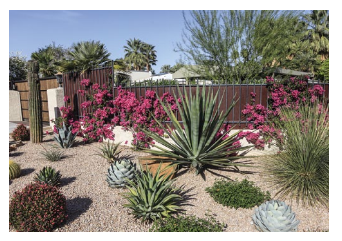
A drought-tolerant garden.