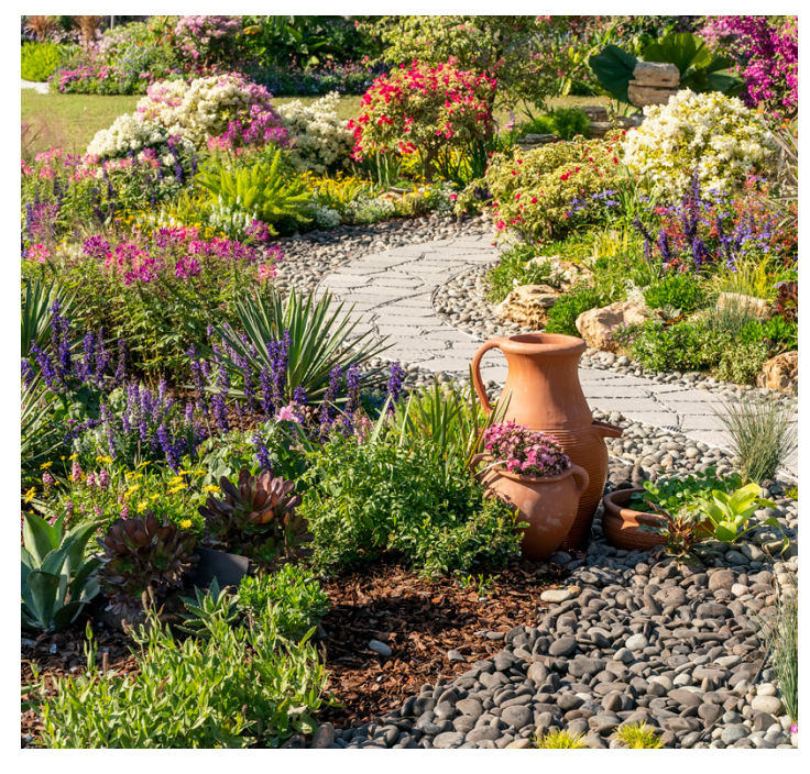
A drought-tolerant garden.

After years of severe drought, California's water supply has improved for many parts of the state. GSWC customers did a tremendous job reducing water use during the last drought, and most have continued those water-efficient practices and made conservation a way of life. GSWC is proud to be your partner in conservation, offering tips and programs to help you manage your water use and control your bill. To learn more about conservation programs and rebates in your area, please visit www.gswater.com/conservation or call 1.800.999.4033.