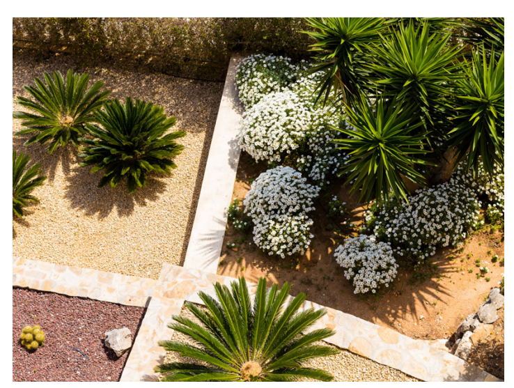
A drought-tolerant garden.

Customers interested in learning more about current and completed infrastructure projects in their service areas are encouraged to visit their service area's webpage at www.gswater.com.