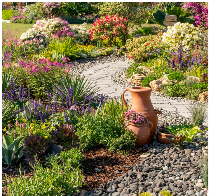
A drought-tolerant garden.

After years of severe drought, California's water supply has improved for many parts of the state. GSWC customers did a tremendous job reducing water use during the last drought, and most have continued those water-efficient practices and made conservation a way of life. GSWC is proud to be your partner in conservation, offering tips and programs to help you manage your water use and control your bill. To learn more about conservation programs and rebates in your area, please visit www.gswater.com/conservation or call 1.800.999.4033.